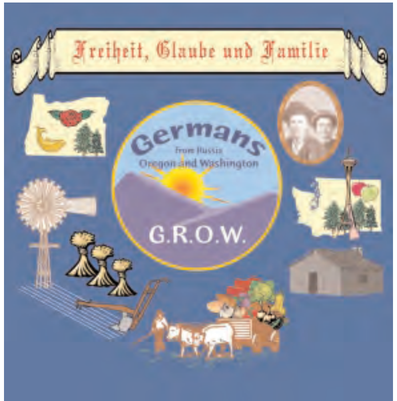
GROW indoor banner.

note...the photos were taken at different times and combined in making this banner. There are no known photos of them together. At the center of the banner is the GROW logo...a circle with blue mountains (Mt. Hood and Mt. St. Helens) and the sun setting behind them. The chapter name "Germans from Russia Oregon and Washington" is at the top in the light blue sky and G.R.O.W. is in white over the mountains. To the right under the photo is the shape of the State of Washington that is known for the Space Needle, apples and fir trees that are symbolized there. Under this is a sod house in tribute to the last standing sod house in Greenway, SD. The bottom left of the banner is to honor our ancestors for working the land. There is a windmill, furrowed field, iron plow and haystacks. Just to the right of this at the bottom of the banner is a farmer leading oxen that are pulling a wagon full of the fruits of their labors.