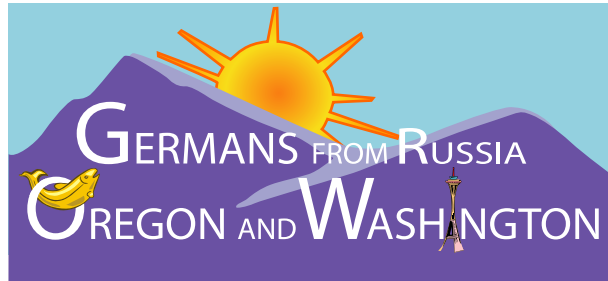
GROW outdoor banner

The outdoor banner features royal blue mountains in the foreground, the left representing Mt. Hood and the right Mt. St. Helens. A sun is setting in the west behind the mountains over a light blue sky. The words "Germans